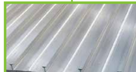
Stiffened Shell Plate