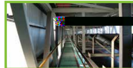
Anti-Slip Aluminium Net